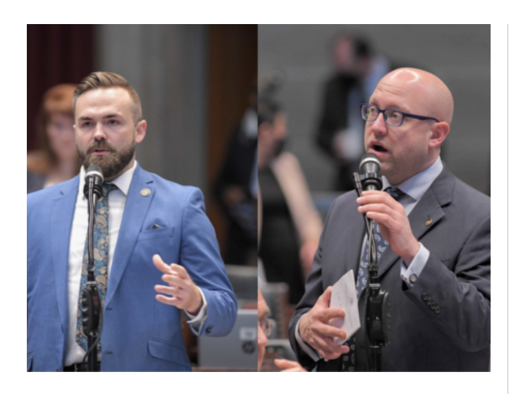
Missouri lawmakers tackle hemp regulation