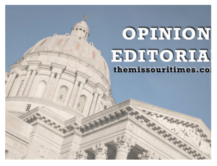
Opinion: The Foundation of a Strong Missouri: Marriage, Love, and Family