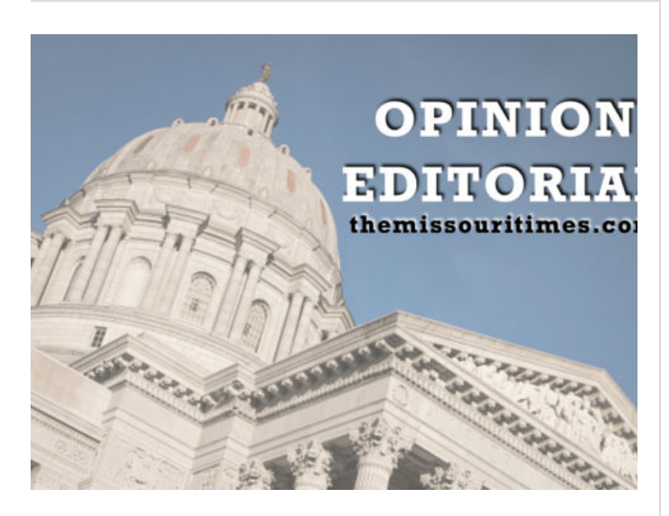
Opinion: Lawfare against Roundup will cause China to own farm chemical supply