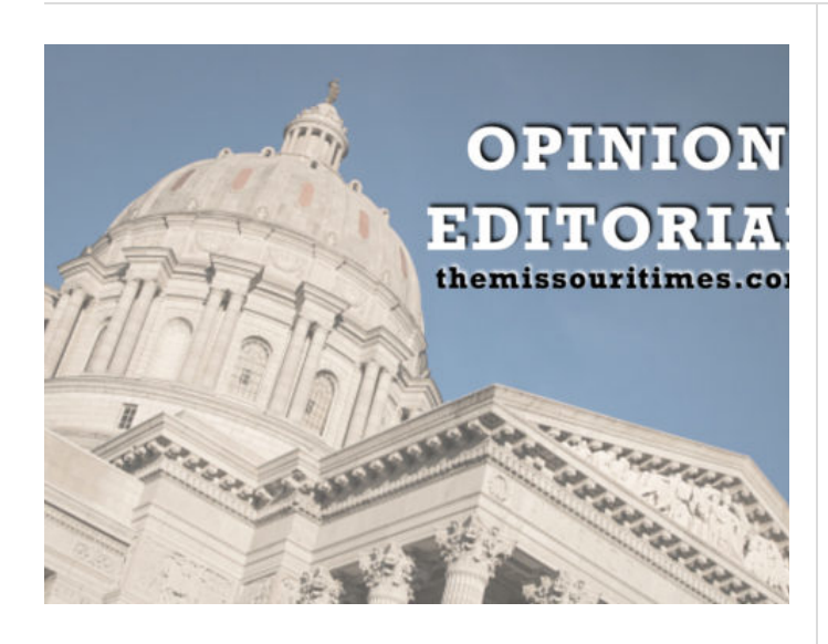
Opinion: Lawfare against Roundup will cause China to own farm chemical supply