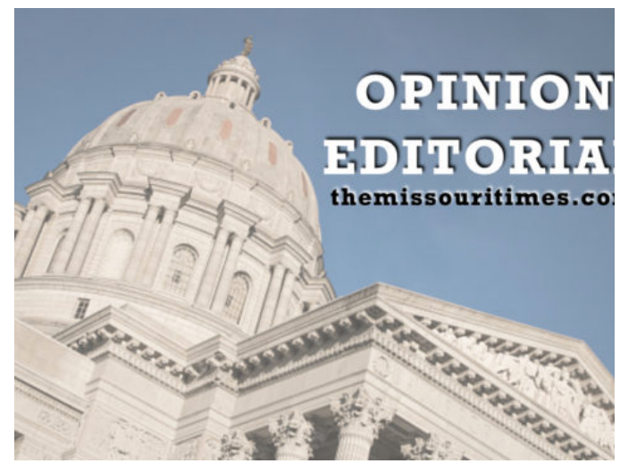
Opinion: General Assembly: Don't Lower the Bridge with Poorly Timed IP Reform