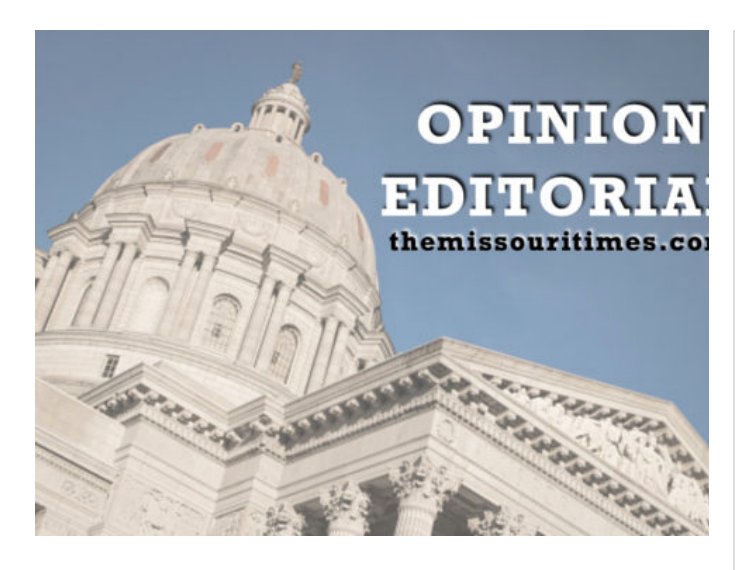
Opinion: We The People must protect our farmers from China's growing grip