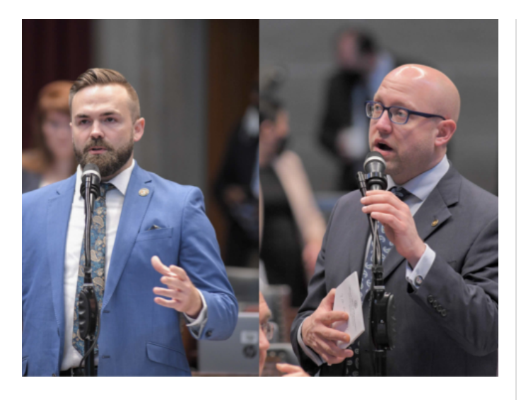
Missouri lawmakers tackle hemp regulation