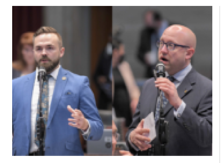
Missouri lawmakers tackle hemp regulation

More from Featured More posts in Featured »